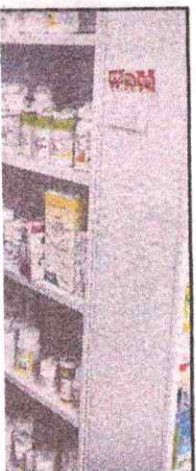
at Basin Pharmacy, Feb. 21.